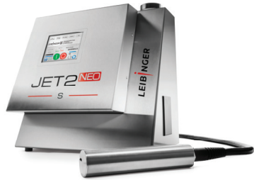
Specialist for ultra-fine printing