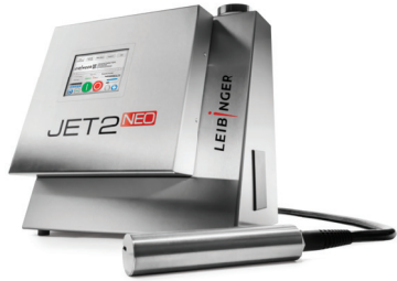
Top choice for standard applications