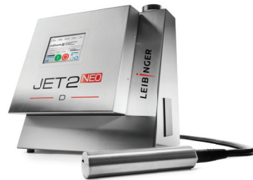
High performer in dusty environments